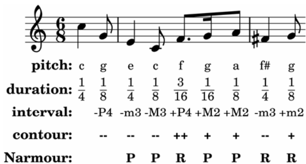
Figure 2: Melody analysis of Franz Schubert's Sängers Morgenlied

One interesting direction in interdisciplinary musicology is the application of machine learning techniques to the task of composer or region attribution. The majority of these algorithms was successfully applied to classify audio files accord to the genres (e.g., Dannenberg et al., 1997; Tzanetakis, 2001). Several researchers suggest to consider the scores of an individual composer as a class. Classification algorithms can then be applied in order to determine the characteristic features that distinguish the classes. Kranenburg & Backer (2004) used the C4.5 algorithm to construct decision trees automatically from training data. Their corpus contained scores from five composers of the Baroque and Classical era that were labeled with the name of the composer. In this corpus the feature vectors of the different compositions of the composers tend to form clusters in the feature space. Therefore, clustering algorithms (e.g., k-means) were able to detect these clusters automatically. Moreover, the decision tree provides insights