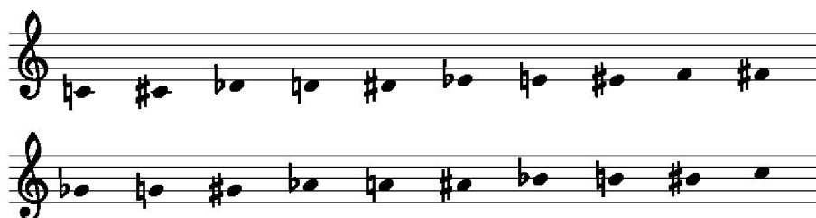
Figure 2. A 'Hyper-chromatic' Scale with 19 Degrees and Tone-Centre on c, using the adopted notation.

In our current version, the 19-ET system is instead notated using only traditional flat and sharp signs, with the division of the scale into extra degrees being accomplished by assigning different pitch values to what would normally be enharmonic equivalents in 12-ET. In addition to practicality, such notation also has historical precedents. For example, it is compatible with the notation used in highly chromatic music of the 17th century, for which, it is thought, one of the various versions of extended meantone tuning could have been used, and for which, in certain areas, notably Flanders and Italy, split-key keyboards with more than twelve keys per octave were sometimes built (Stembridge 1992, 1993 and 1994). Mandelbaum also mentions one or two more modern keyboards which were designed to play in 19-ET, beginning with Peter Samuel Munck's harmonium, built c1850 and now in the Stockholm Musikmuseet. The notation, using this system, of a 19-ET 'hyper-chromatic' scale with nineteen degrees, based on c', is shown in Figure 2.