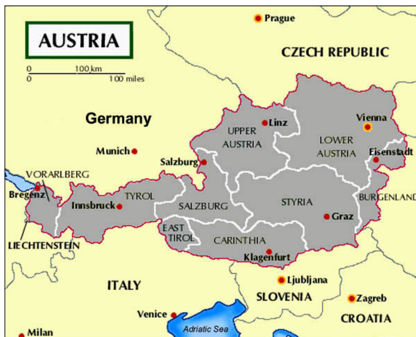
Figure 2: Map of Austria; Styria with its capital in the South/East of Austria and bordering to Slovenia.

The area of Styria is geographically very diverse, with high mountain regions (alps) in the north and west and flat and hilly lands in the south-eastern part.